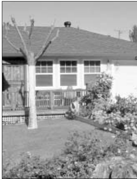
Good neighbors take pride in well maintained homes