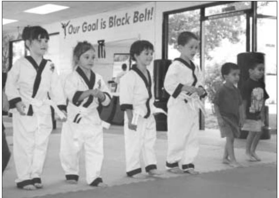
Enthusiastic taekwondo students line up for a lesson. Youngsters will also find chess, tap dancing, drumming, ballet, guitar and many other classes offered in the Winter Activity Guide.

With the holidays upon us, check out Harry Potter's Night Out for ages