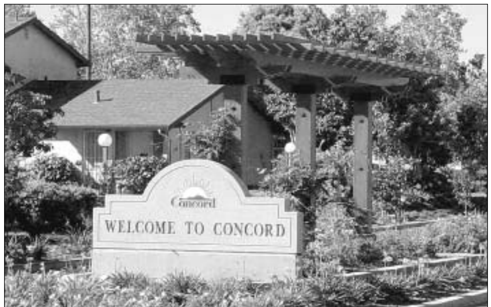
Motorists coming into Concord on Willow Pass Road from Hwy. 4 are now greeted by this striking new entry feature. In addition to the signage, the median design includes an arbor and landscaping in colors that echo the City's logo - yellow lilies and blue agapanthas.

Residents who use parks and play fields may never realize what it takes to keep See Innovation, page 2