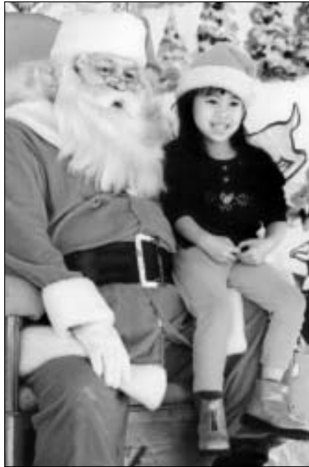
A young girl talks things over with Santa at the Santa's Grand Arrival event in Todos Santos Plaza. This year the event will take place on Saturday, December 13.