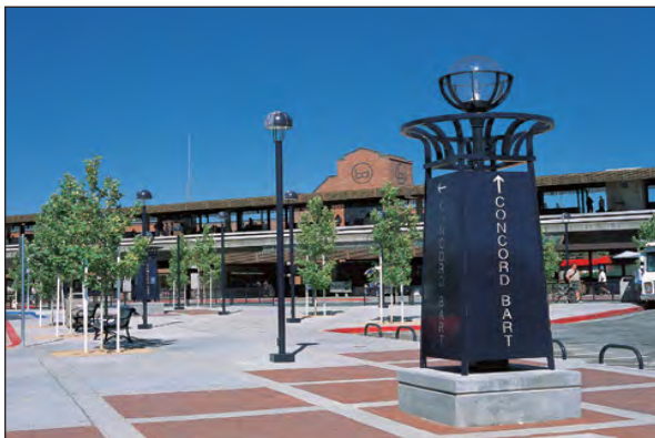
Downtown BART Station Plaza