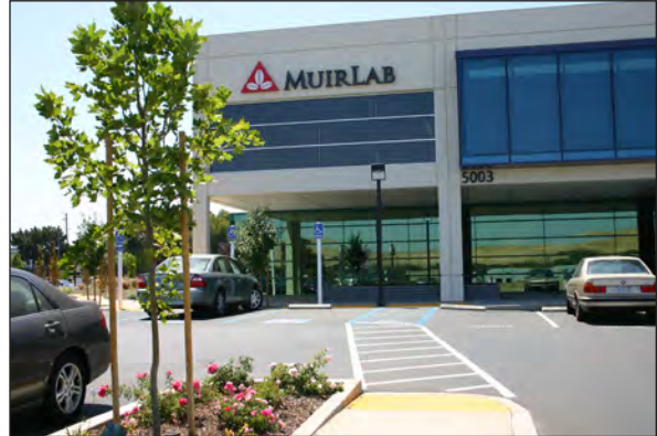
John Muir Health Core Lab

These emerging industries may have special needs with respect to infrastructure, workforce development, Zoning and General Plan issues, and business services. The City will incorporate the needs of these key industries as it works to continuously improve its delivery of efficient, effective business services, and as it continues to update the Zoning Code (scheduled for completion in 2010) and other City policies.