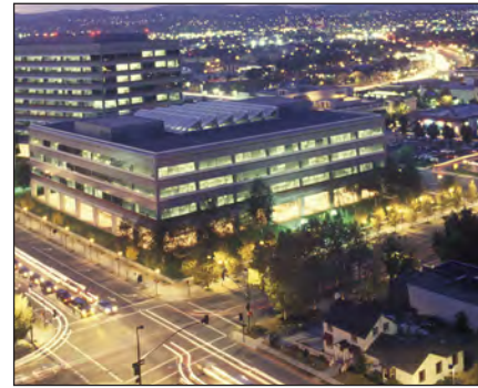
Bank of America Tech Center